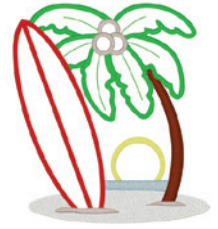
SURF BOARD & PALM TREES* File: NT1263 (15) 3.45"W X 3.84"H ST: 7,862 (12) Colors: 7 1. Yellow7 2. Blue Gray 3. Lt. Lt. Beige 4. Dk. Brown 5. Lt. Green2 6. Red 7. Beige