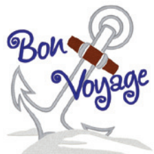
BON VOYAGE* File: NT1267 (15) 3.40"W X 3.53"H ST: 7,248 (12) Colors: 4 1. Off-White 2. Dk. Brown 3. Med. Gray 4. Off-White 5. Dk. Dk. Blue2