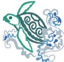
SEA TURTLE* File: NT1265 (15) 3.51"W X 3.44"H ST: 8,613 (12) Colors: 5 1. Teal3 2. Dk. Dk. Teal 3. Teal3 4. Dk. Dk. Teal 5. Lt. Blue 6. Blue4 7. Dk. Blue5