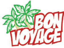
BON VOYAGE* File: NT1261 (15) 3.90"W X 2.84"H ST: 7,627 (12) Colors: 3 1. Lt. Tangerine 2. Red 3. Lt. Green2