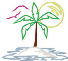
ISLAND WITH PALM TREES* File: NT1264 (15) 3.85"W X 3.43"H ST: 7,419 (12) Colors: 6 1. Blue Gray 2. Yellow7 3. Dk. Brown 4. Lt. Lt. Beige 5. Lt. Green2 6. Dk. Dk. Pink