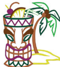
TIKI DRINK W/ PALM TREE* File: NT1268 (15) 3.45"W X 3.95"H ST: 11,031 (12) Colors: 6 1. Dk. Dk. Yellow 2. Dk. Beige 3. Dk. Dk. Green 4. Dk. Red4 5. Lt. Green 6. Dk. Dk. Brown