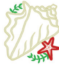
CONCH SHELL* File: NT1262 (15) 3.42"W X 3.80"H ST: 6,937 (12) Colors: 3 1. Lt. Green2 2. Red 3. Lt. Lt. Tangerine